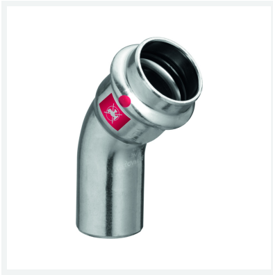
Prestabo Elbow 45° with SC-Contur Model 1126.1 Article 558 376