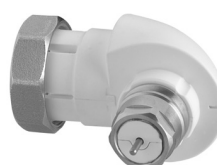
Angle adapter 013G1360