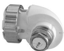
Angle adapter 013G1350