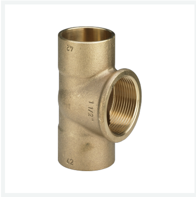
T-piece Model 94130G Article 103 767